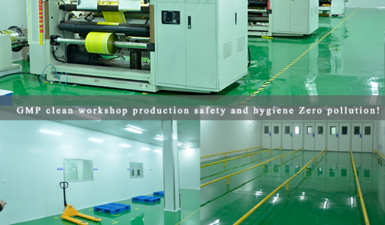
GMP clean workshop production safety and hygiene Zero pollution!