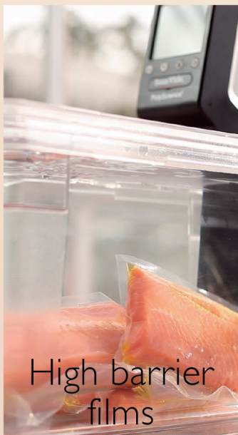
High barrier films

“Our embossed film are made of food-grade materials. They are BPA-free, phthalate-free, and approved by FDA for cooking.”