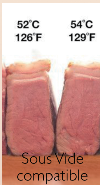
Sous Vide compatible

“Cook food Sous Vide using our high-quality and reliable vacuum-sealed pouches. Achieve perfect repeatable results.”